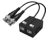
PFM800-E Passive HDCVI Balun