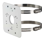
PFA152-E Pole mount